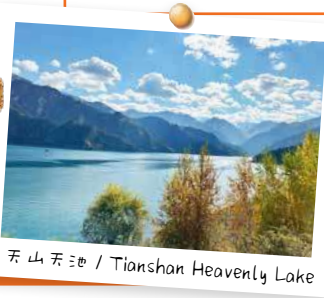
天山天池 / Tianshan Heavenly Lake