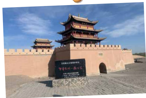
嘉峪关城楼 / Jiayuguan Great Wall