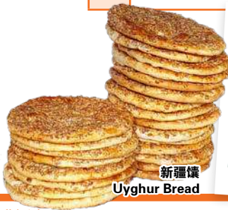
新疆馕 Uyghur Bread