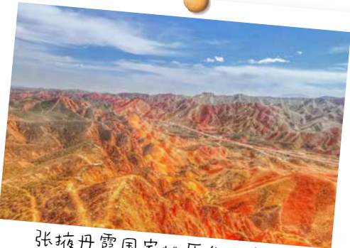
张掖丹霞国家地质公园景区 Zhangye Danxia National Geopark

嘉峪关是矗立在明代长城西端的一个关隘。与众所周知的石砖长城不同, 嘉峪关长城采用夯土筑成, 以黄色为主色调, 与周围的沙漠融为一体。