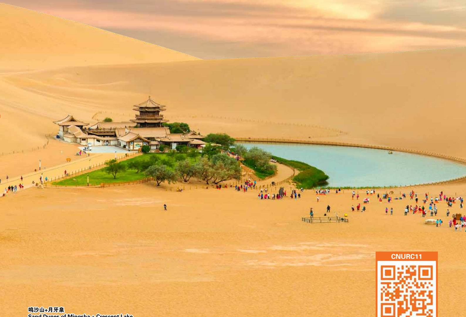
鸣沙山+月牙泉 Sand Dunes of Mingsha + Crescent Lake

西安 | 兰州 | 武威 | 张掖 | 嘉峪关 | 敦煌 | 吐鲁番 | 乌鲁木齐 XIAN | LANZHOU | WUWEI | ZHANGYE | JIAYUGUAN | DUNHUANG | TURPAN | URUMQI