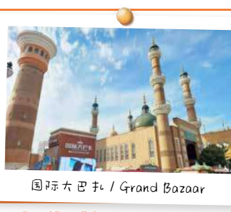
国际大巴扎 / Grand Bazaar